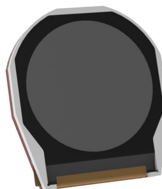
The uLCD-220RD Display Module