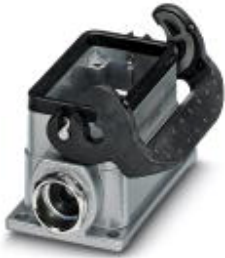
Box mounting base, with single locking latch, height 52 mm, with screw connection, 2x Pg16

Please be informed that the data shown in this PDF Document is generated from our Online Catalog. Please find the complete data in the user's documentation. Our General Terms of Use for Downloads are valid ( http://phoenixcontact.com/download )