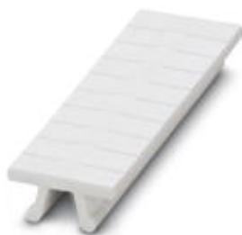
Zack marker strip, Strip, white, unlabeled, can be labeled with: CMS-P1-PLOTTER, PLOTMARK, mounting type: snap into tall marker groove, for terminal block width: 3.5 mm, lettering field size: 3.5 x 10.5 mm

Please be informed that the data shown in this PDF Document is generated from our Online Catalog. Please find the complete data in the user's documentation. Our General Terms of Use for Downloads are valid ( http://phoenixcontact.com/download )