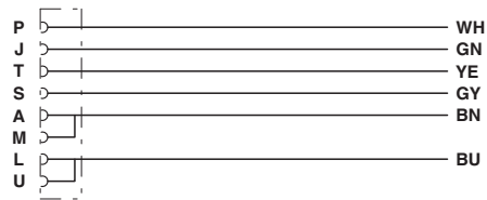
Contact assignment of the M16 socket