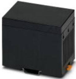
Electronic module, for PCB insertion, with a 12.5 mm tall covering hood

Please be informed that the data shown in this PDF Document is generated from our Online Catalog. Please find the complete data in the user's documentation. Our General Terms of Use for Downloads are valid ( http://phoenixcontact.com/download )