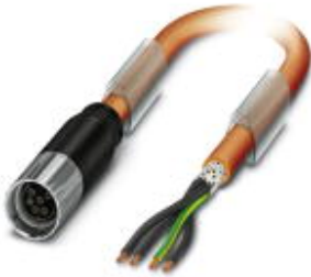
Cable plug in molded plastic, Length: 2 m, Color of outer sheath: orange RAL 2003

Please be informed that the data shown in this PDF Document is generated from our Online Catalog. Please find the complete data in the user's documentation. Our General Terms of Use for Downloads are valid ( http://phoenixcontact.com/download )