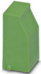
Filler plugs, for unoccupied terminal points

Please be informed that the data shown in this PDF Document is generated from our Online Catalog. Please find the complete data in the user's documentation. Our General Terms of Use for Downloads are valid ( http://phoenixcontact.com/download )