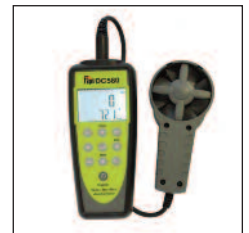
DC580 with vane probe