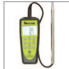
DC580 with hot-wire probe