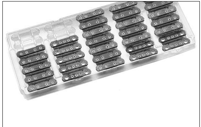
Figure 15-2 — SurfMates; Individual part numbers