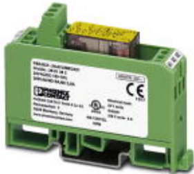
Universal safety relay with forcibly guided contacts, two PDT contacts, for U_N 120 V AC/DC

Please be informed that the data shown in this PDF Document is generated from our Online Catalog. Please find the complete data in the user's documentation. Our General Terms of Use for Downloads are valid ( http://phoenixcontact.com/download )