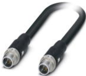
Assembled Ethernet cable, CAT5e, shielded, 8-wire, 4 x 26 AWG (data) and 4 x 20 AWG (power), RAL 9005 (black), M12 hybrid plug to M12 hybrid plug, length: 20.0 m

Please be informed that the data shown in this PDF Document is generated from our Online Catalog. Please find the complete data in the user's documentation. Our General Terms of Use for Downloads are valid ( http://download.phoenixcontact.com )