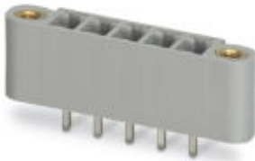
The figure shows the 5-pos. version of the product in gray

Header, Nominal current: 8 A, Rated voltage (III/2): 160 V, Number of positions: 17, Pitch: 3.81 mm, Color: pastel green, Contact surface: Tin, Mounting: Wave soldering