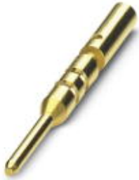
Crimp contact, turned, Contact diameter: 0.8 mm, Crimp range: 0.08 mm 2 ...0.25 mm 2

Please be informed that the data shown in this PDF Document is generated from our Online Catalog. Please find the complete data in the user's documentation. Our General Terms of Use for Downloads are valid ( http://phoenixcontact.com/download )