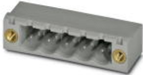
The figure shows a 5-pos. version of the product in gray

Header, Nominal current: 12 A, Rated voltage (III/2): 320 V, Number of positions: 11, Pitch: 5 mm, Color: black, Contact surface: Tin, Mounting: Wave soldering