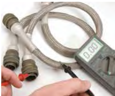
Flexo Shield can provide end-to-end shielding solution on your application.