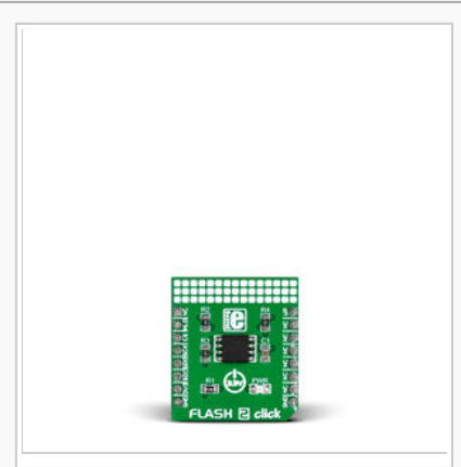
Flash 2 click