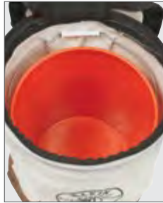
Holds 5 gallon bucket (not included)