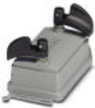
HEAVYCON ADVANCE IP65 protective cover B10, with bayonet locking, with retaining cord, diameter of retaining cord eyelet 3 mm

Protective covers - HC-B 10-TMB-SD-IP65 - 1690943