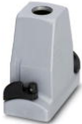
HEAVYCON ADVANCE EMV sleeve housing B10, with bayonet locking, height 100 mm, with 1x M25 thread, straight cable outlet

Please be informed that the data shown in this PDF Document is generated from our Online Catalog. Please find the complete data in the user's documentation. Our General Terms of Use for Downloads are valid ( http://download.phoenixcontact.com )