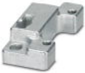
Panel mounting flange for HEAVYCON ADVANCE TMB housing with bayonet locking