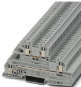
Installation level terminal block, Screw connection, Cross section: 0.2 mm 2 - 4 mm 2 , AWG: 24 - 12, Width: 5.2 mm, Color: gray, Mounting type: NS 35/7,5, NS 35/15

Please be informed that the data shown in this PDF Document is generated from our Online Catalog. Please find the complete data in the user's documentation. Our General Terms of Use for Downloads are valid ( http://phoenixcontact.com/download )